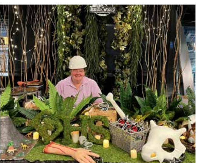
Held at McCamish Pavilion, February's Chili Cookoff provided an incredible 24 entries for best chili and 17 entries for dessert. A visual feast for the eyes as well, 20 individual groups and departments participated in a table or booth decorating contest. After a long hiatus because of the pandemic, I&S employees returned in full force dressing to accompany their booth design and chili theme. Photos (left to right): Area 5 wins 2nd place for their chili entry. Building Services participated with a Mardi Gras themed booth. Area 3 chose a carnival design while the Finance and Accounting group appropriately set up a "Bean Counter Cafe". Building Services Zone 8 were the ultimate chili champions, while EH&S stunned with an elaborate Jurassic Park-themed booth.