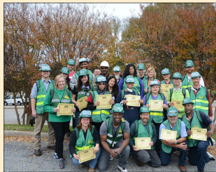
CERT graduates are part of a growing campus response team.