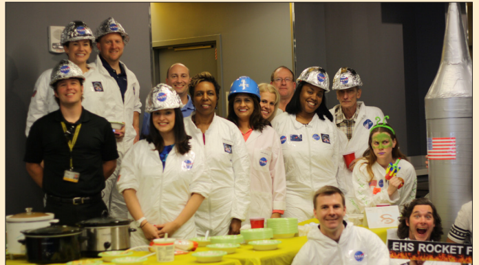
The EHS Department went all out, displaying thier Rocket Fuel pride.