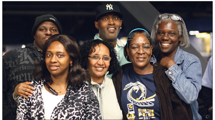
Area 5 Team