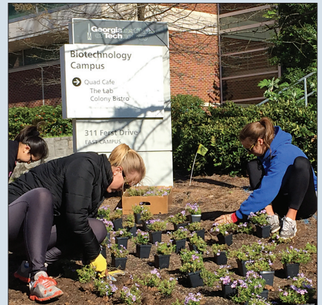
Students planting perennials in the Biotech Quad