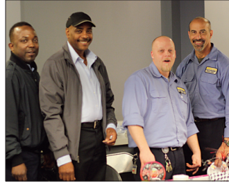
Utilities Maintenance Team