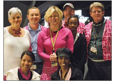
Design and Construction Team