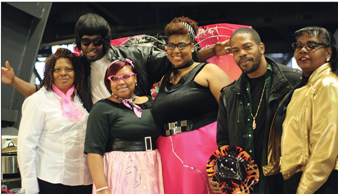
Best Booth Winners Zone 12