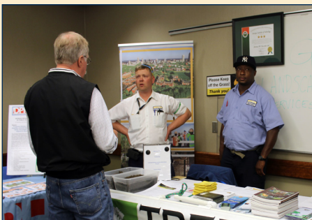
Landscape Services sharing Tree Campus USA information.