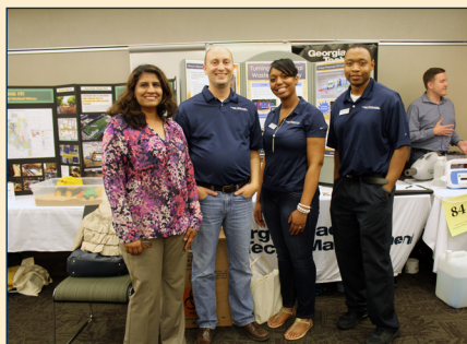
EHS team members gather for a group photo.