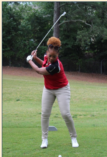
Georgia Tech staff came from departments all across campus to support Facilities Management.