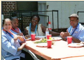
Celebrating another great year at Facilities Management with good times and even better food.