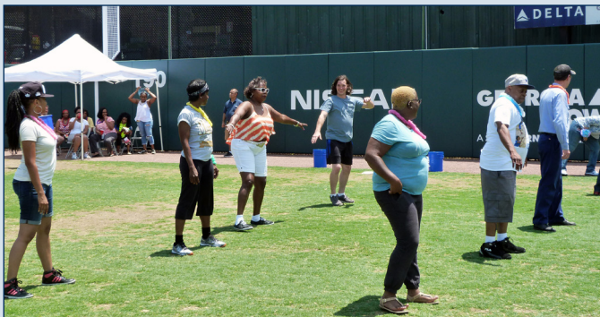
The excitement of the relay race got chilly with an ice-melting challenge.