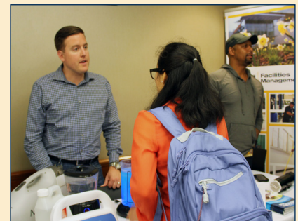
The Custodial booth members explaining their newest engineered water equipment.