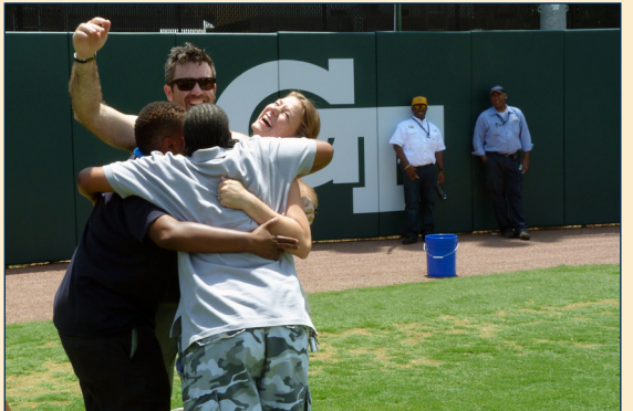
The winners of the relay race celebrate their big win.