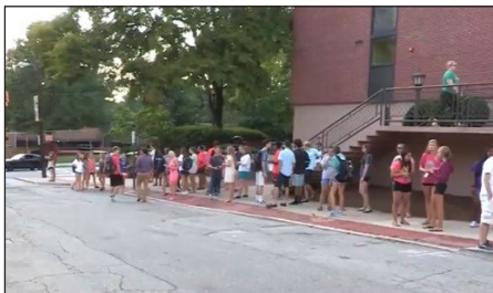
Students leaving their residential building in a calm and orderly fashion.