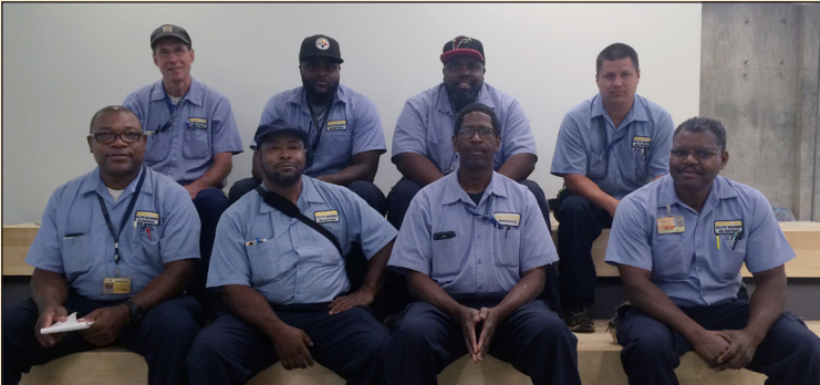
Members of Maintenance Area 3 attending new building systems training for Bogs.