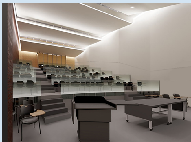
Howey Physics Building renovation